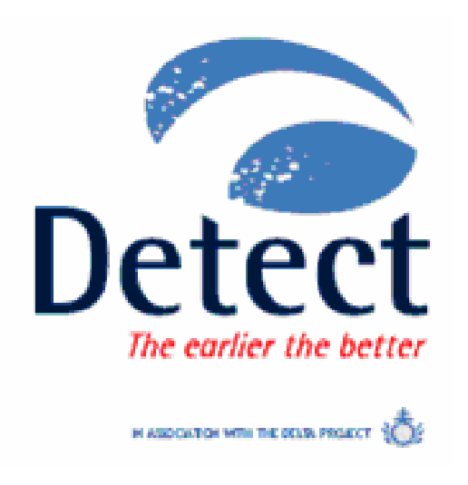
The DETECT Team 2007